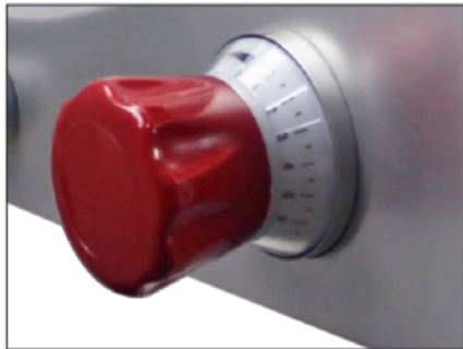
Precision slicing with the micrometric slice thickness knob.