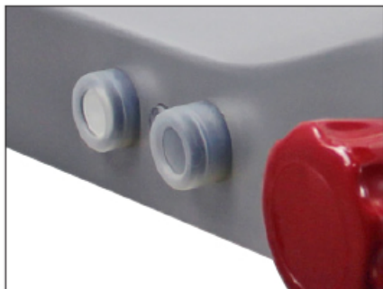
Simple, low-voltage switches turn the 350IX on and off.