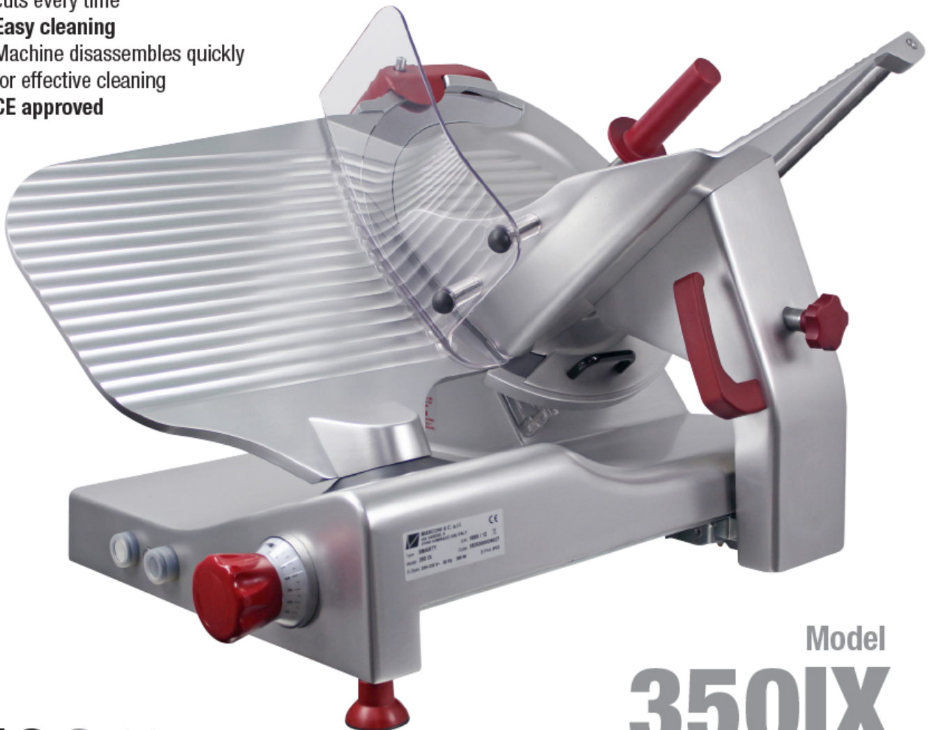
Model 350IX Gravity-feed Slicer